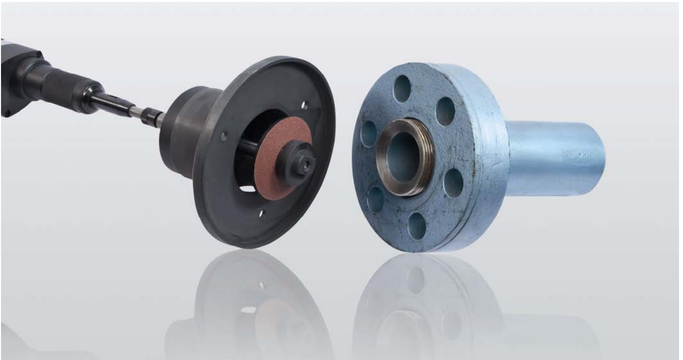
EFCO-LS with guide bush

Precise special guides provide for completely centred machining of the sealing face.