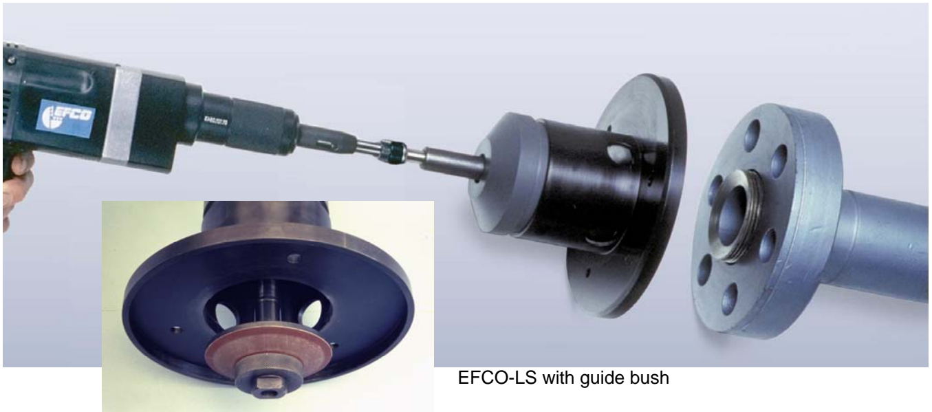
EFCO-LS with guide bush

Precise special guides provide for completely centred machining of the sealing face. Guide bushes are used for small nominal diameters. Even for large diameters, our special jaw chucks enable precise guiding of the grinding tool.